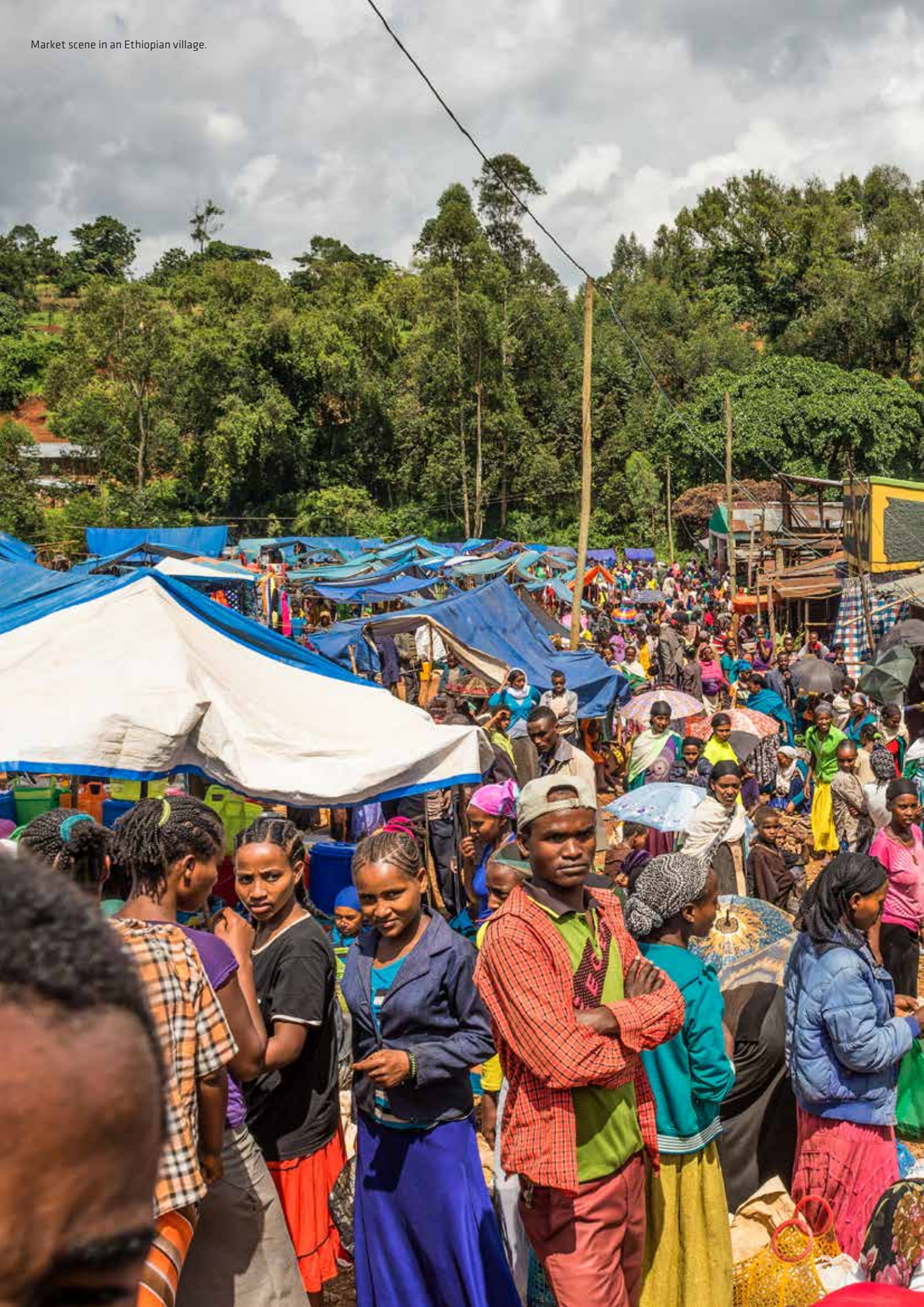
Market scene in an Ethiopian village.