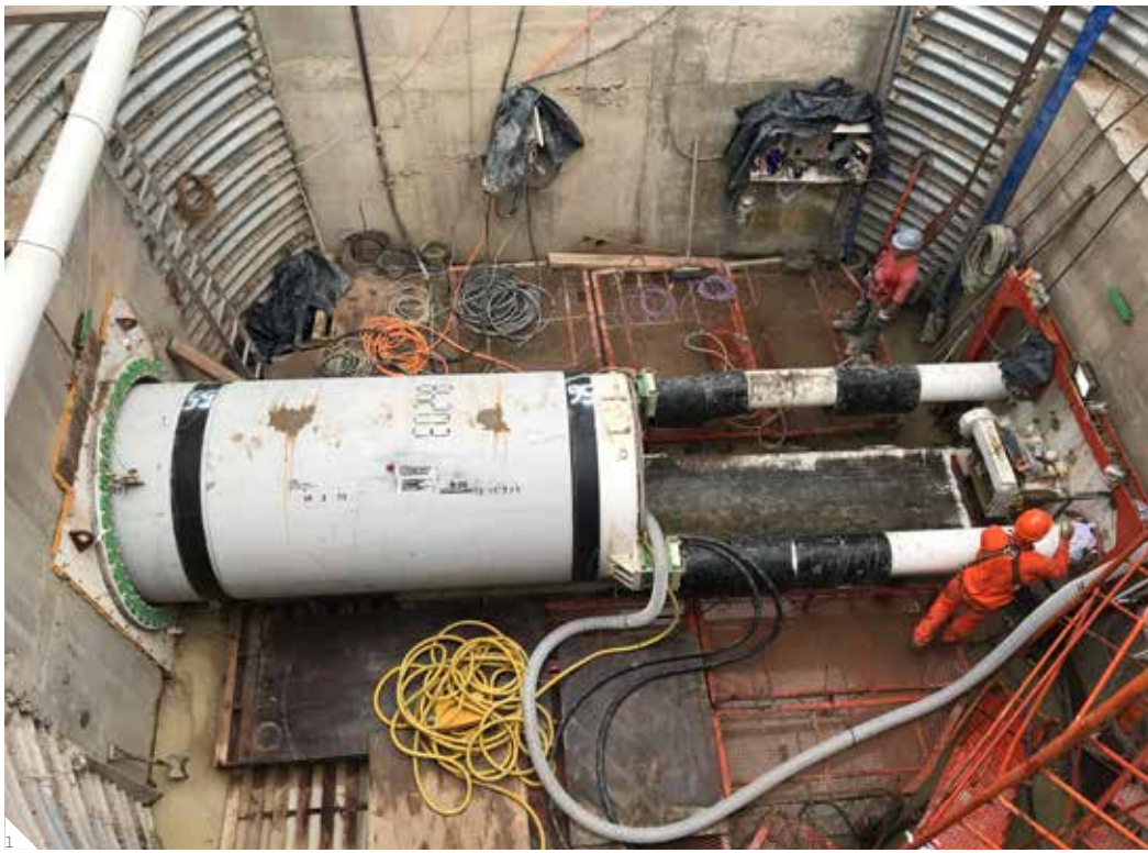
1 Micro TBMs with diameters starting from few centimeter up to 4 - 5 m excavate tunnel facilities used for the transport of water, sewage or even electrical lines.