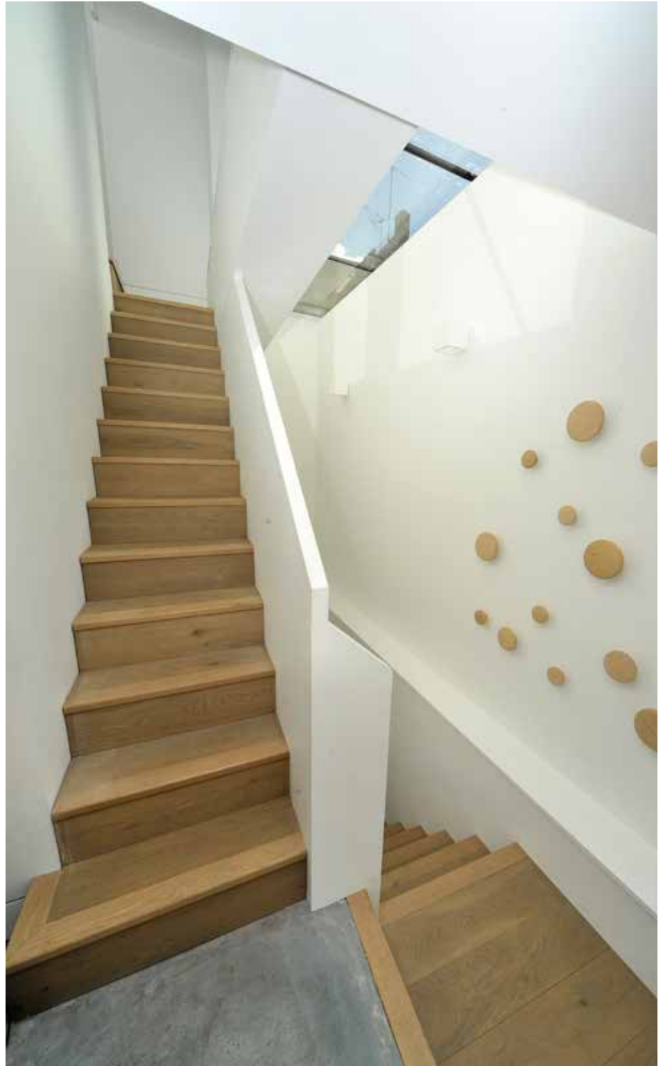
Oiled and brushed oak flooring not only complemented the concrete flooring but also added to the stylish, contemporary look flowing throughout the house.