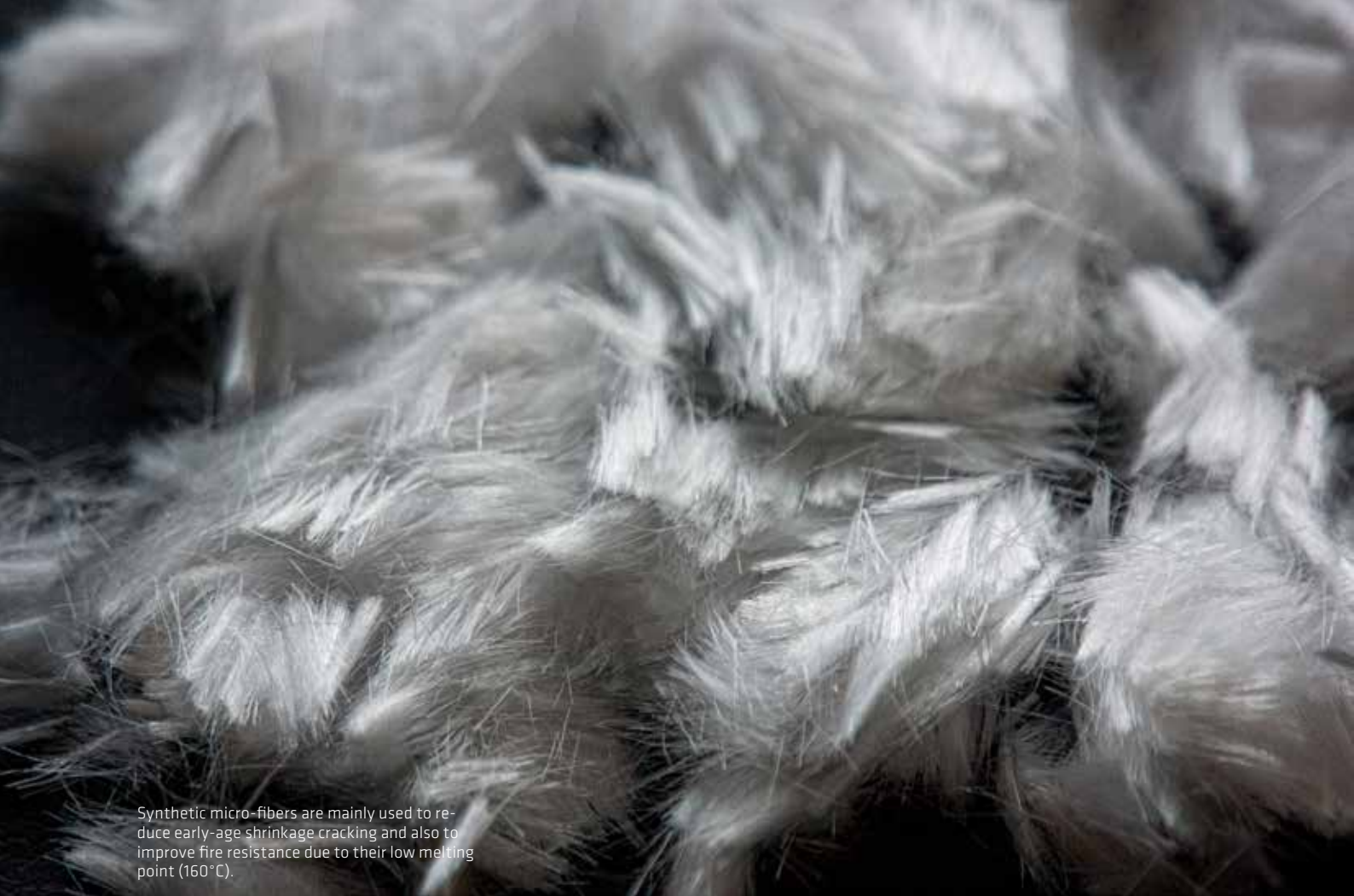
Synthetic micro-fibers are mainly used to reduce early-age shrinkage cracking and also to improve fire resistance due to their low melting point (160°C).