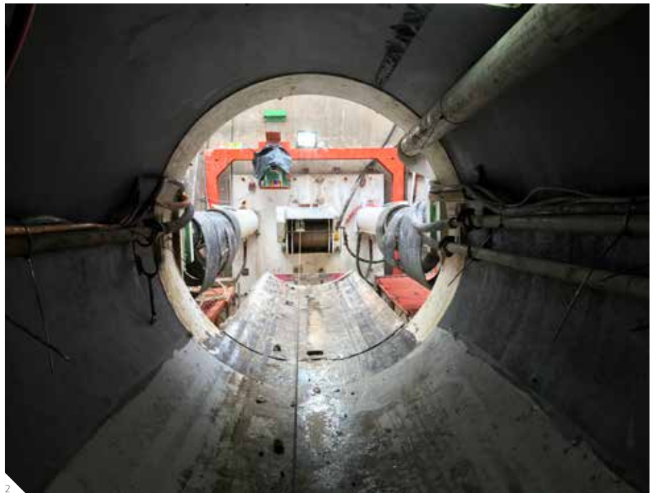
2 The project in Buenos Aires was to install bigger pipes and the increase of capacity of the treatment plant in order to improve the life quality of around 30.000.

> Twenty one EPB TBMs excavated the brand new Metro system in Doha in world record time, the Grand Paris Metro Extension just starting with several EPB TBMs, the hard rock shield TBMs making excavation of important hydropower projects in the Andes Mountains in different countries in south America or just the strong gripper TBMs used to excavate the Gotthard Tunnel in Switzerland, which few years ago became the world's longest rail tunnel, are clear examples of the important of the TBM technology.