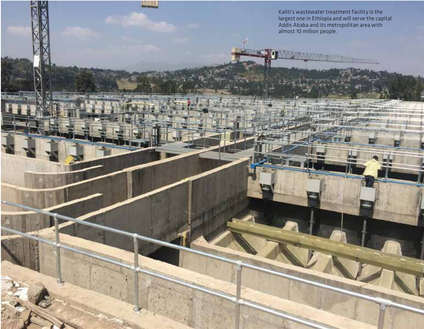
Kaliti's wastewater treatment facility is the largest one in Ethiopia and will serve the capital Addis Ababa and its metropolitan area with almost 10 million people.