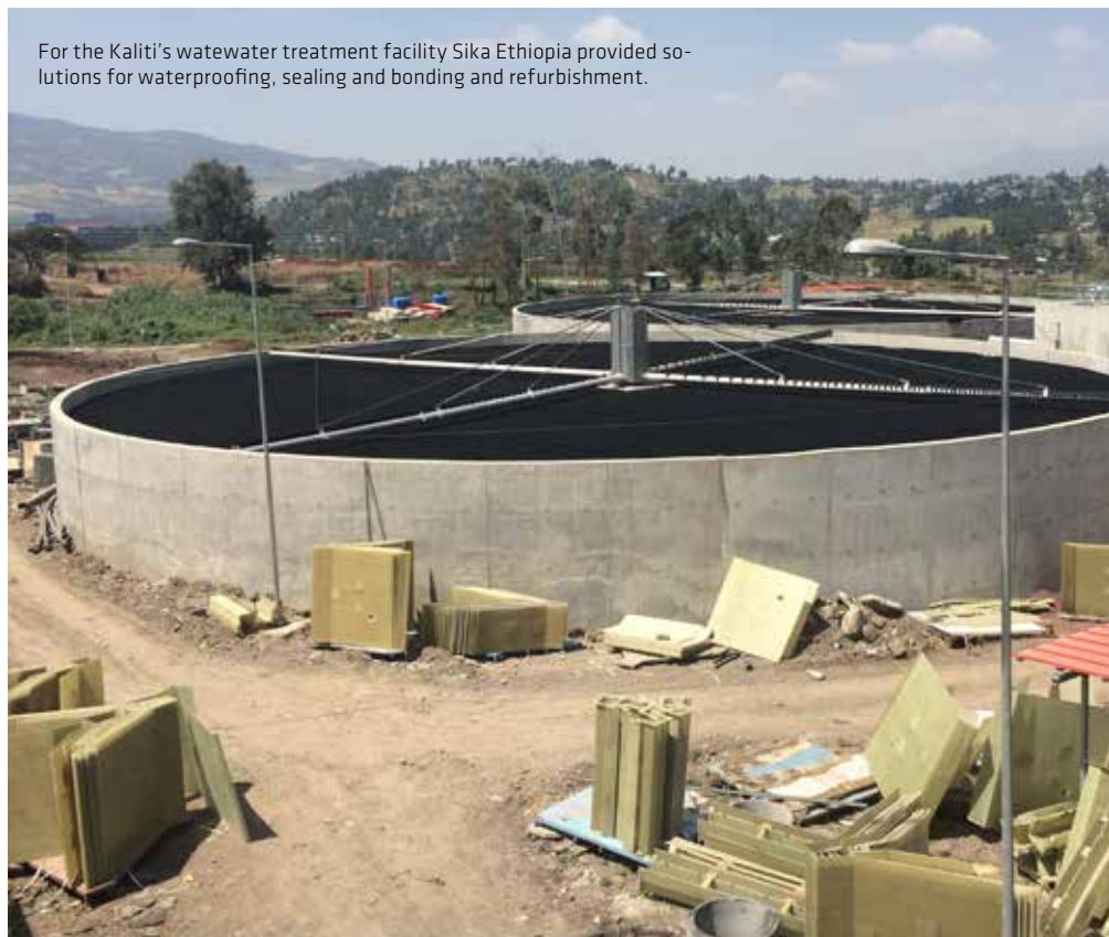
For the Kaliti's wastewater treatment facility Sika Ethiopia provided solutions for waterproofing, sealing and bonding and refurbishment.