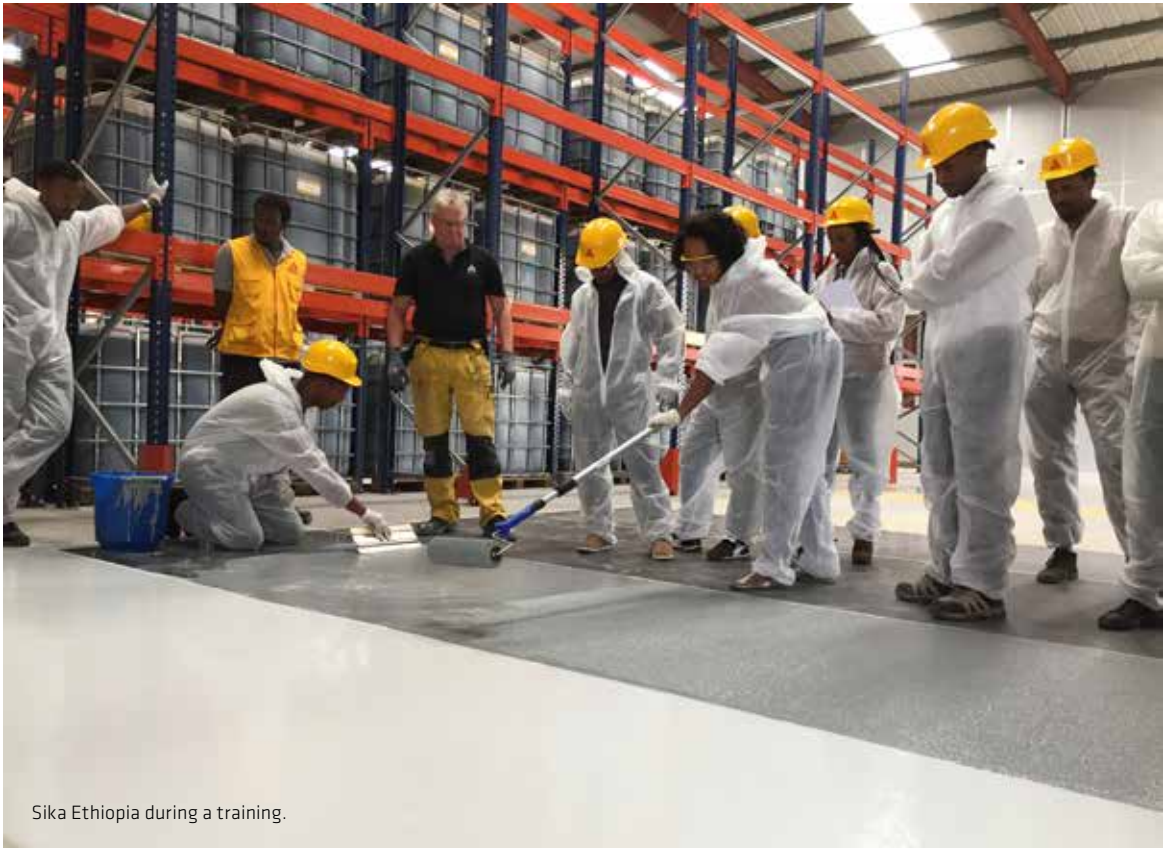
Sika Ethiopia during a training.