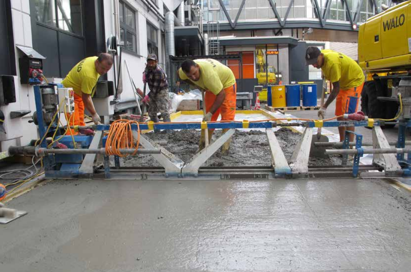
Fibers are used to improve the fatigue behavior of the new concrete topping.

> Synthetic fibers are less abrasive. SikaFiber® Force synthetic fibers are produced in fiber bundles wrapped with a water soluble film (fiber pucks) for easy dosing and can be ordered in big-bags for large job sites or in 5kg water-soluble bags that can be dosed directly into a concrete mixer. This innovative waste-reducing solution has won Sika several packaging prizes.