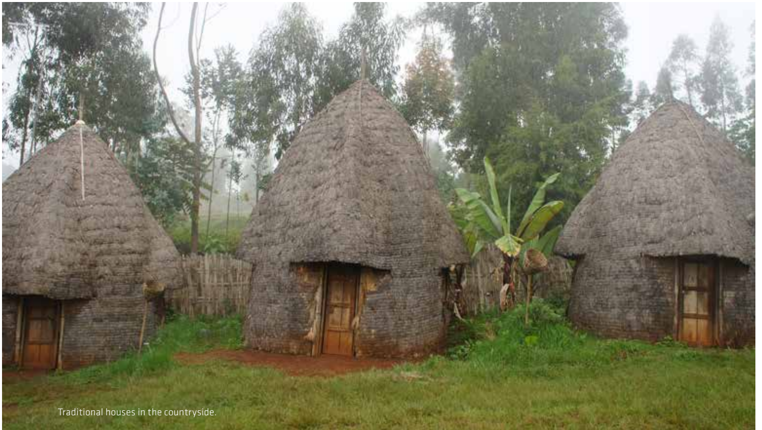
Traditional houses in the countryside.