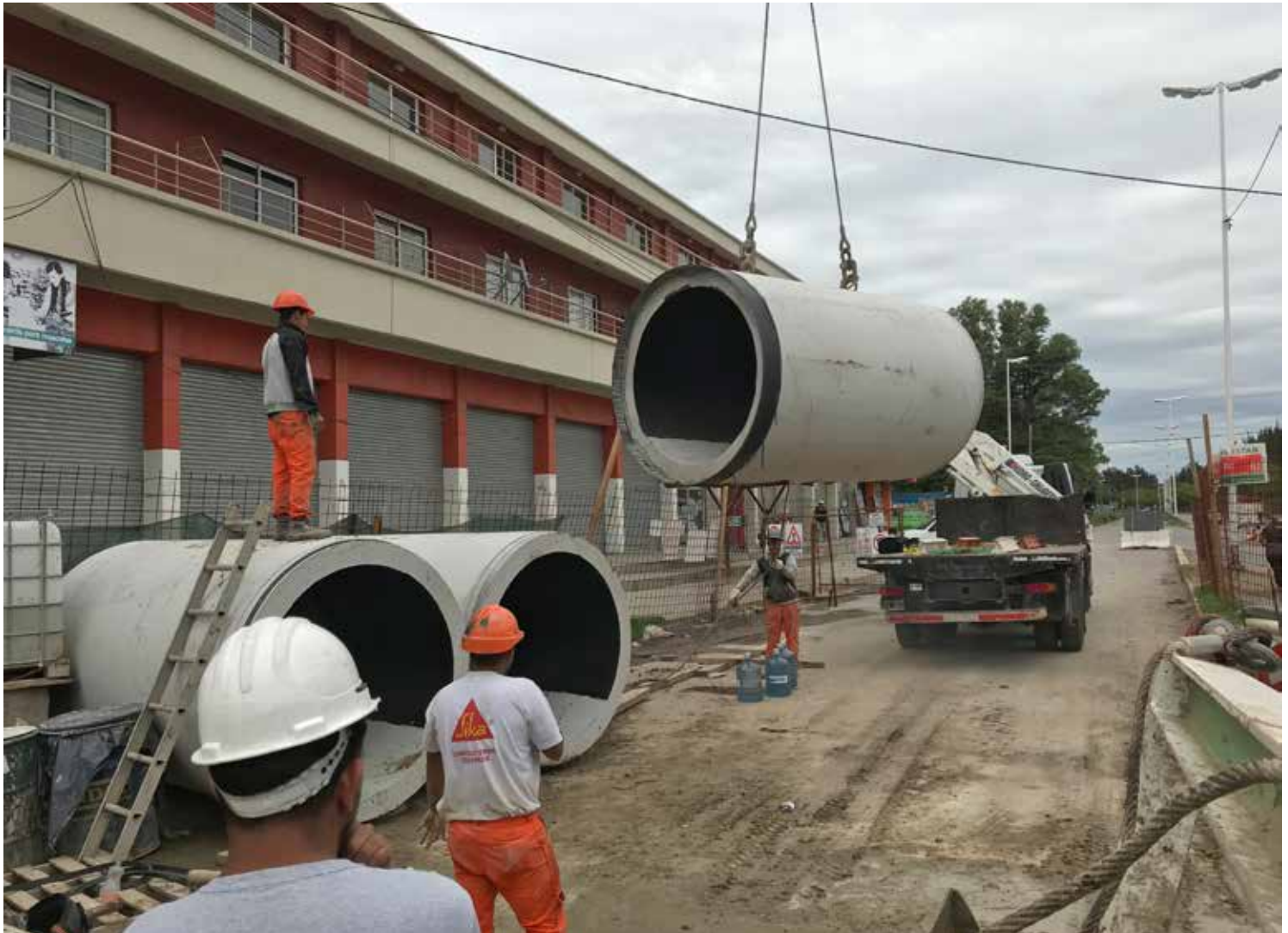
The small tunnel is built out of precast elements. Sika® Foam TBM 101FB optimizes the consumption, makes a better conditioning of the excavated ground and allows a smooth and constant excavation with TBM speeds over 100 mm/min.