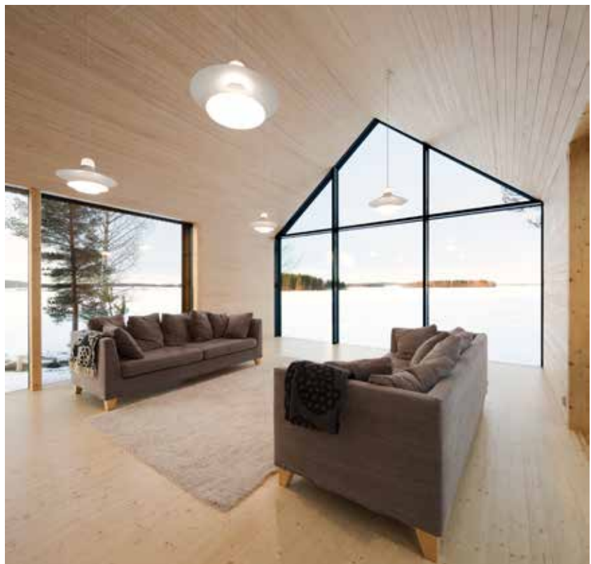
The living room with a great view of the landscape.

conscious age, we will inevitably need to build more ecologically responsible and sustainable buildings. Smart architecture develops a close relationship between people, natural resources and the sustainable living of our future. Energy efficiency over the entire life cycle of a