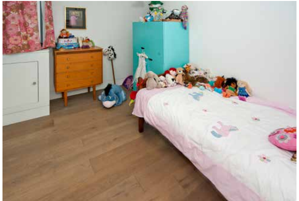
Great when you have kids in the house: SikaBond®-52 Wood Floor reduces footfall noise and dampening sound.