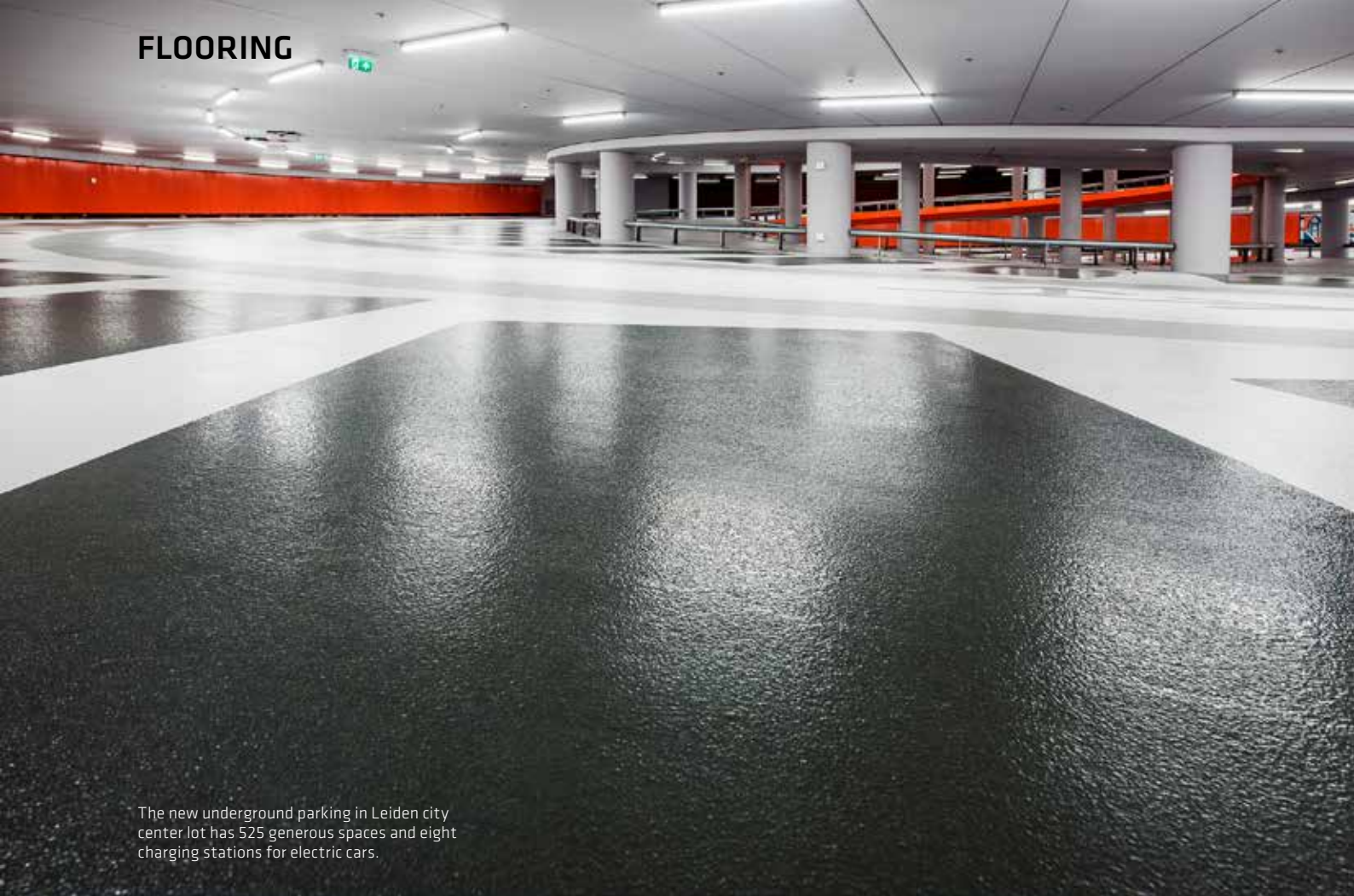
The new underground parking in Leiden city center lot has 525 generous spaces and eight charging stations for electric cars.